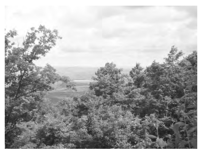
8. The Power Authority's upper reservoir of the Blenheim-Gilboa pump storage complex is also part of the view. After returning to the Long Path from the loop trail, hikers will return to Macumber Road or continue east past Ashland Pinnacle to Bluebird Road in the town of Conesville.