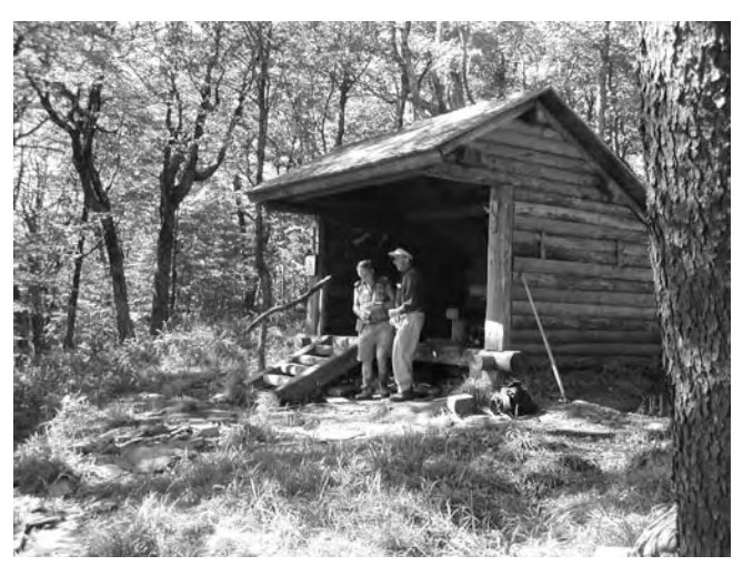
5. Huntersfield Mountain Lean-to is a great place to take a break from the hike up the mountain. The lean-to was built and the views cleared by the inmates from the Summit Shock Camp.