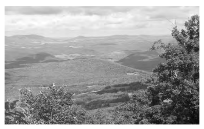
7. The yellow trail is a quarter mile long and loops back to the Long Path trail. Hikers continuing on the yellow trail will have a westerly view that includes a large portion of Schoharie County. Mount Utsayantha can also be seen from this point.