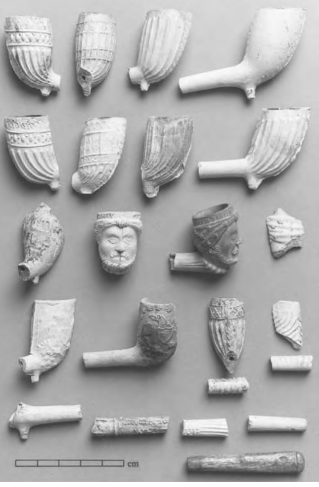
Pipes from the J. Reed Site, Gilboa, NY: Rows 1 and 2: Fluted and plain pipe forms; Row 3: L-R, "TD" pipe with stars, "Tirks Head" effigy piped; Row 4: L-R Shield and Eagle pipes, fluted forms. Row 5: decorated pipe stems, Row 6: wood or bone pipe stem from a composite pipe.