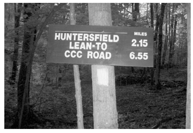
From the parking area at Macumber Road to the peak of the mountain is 2.15 miles. Macumber Road is accessed from Greene County Routes 10 and 11 out of Prattsville.

The trail to the mountain is on the Huntersfield State Forest, which is administered by the Department of Environmental Conservation. The trail is maintained by volunteers from the NY/NJ Trail Conference and from the Long Path North Hiking Club.