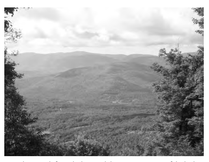
6. Looking south from the lean-to, hikers can view some of the higher peaks of the Catskills. Hunter Mountain and Slide Mountain can be seen from here.