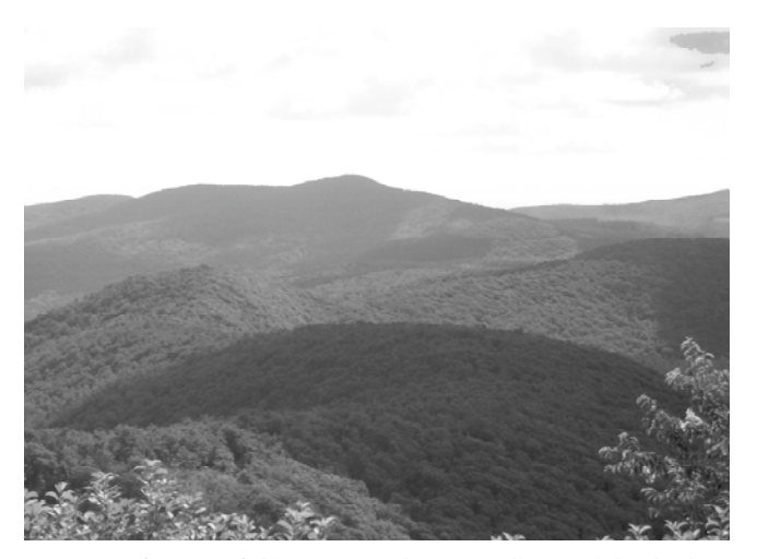
4. On top of Huntersfield Mountain there is a yellow trail that leads to a lean-to. Before the lean-to, there is a nice view to the east showing the ridge line the Long Path follows to Ashland Pinnacle.