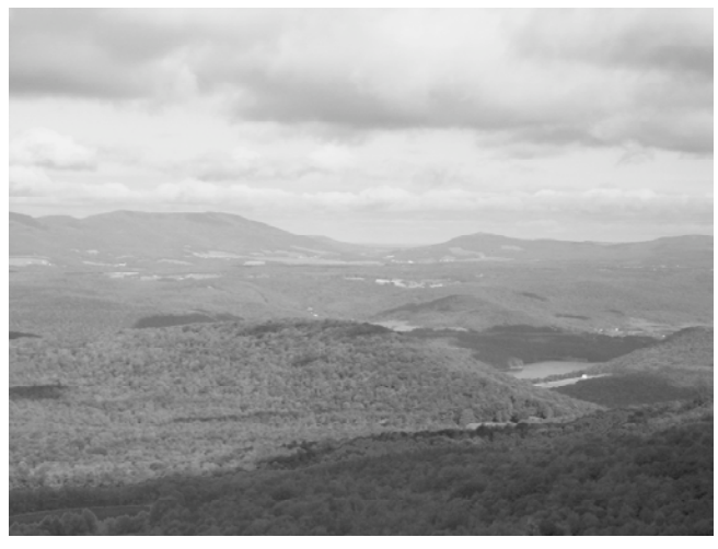
3. Part way up the mountain there is an opening from a ledge with a westerly view looking into Schoharie County. The Gilboa Reservoir can be seen from this point.