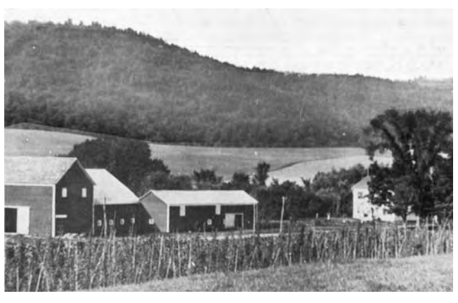
The Hynes Farm, Hyndsville, 1910.