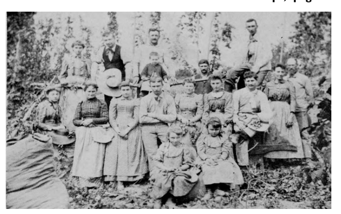
Hop Picking, Patrie Farm, Janesville, about 1895.