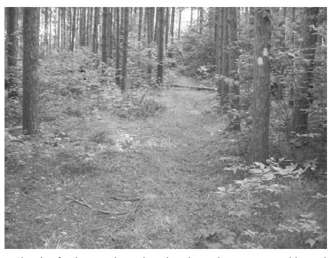
2. Shortly after leaving the parking lot, the trail intersects an old wood road. It continues on this road for about a half of a mile before turning sharply uphill. This picture shows the Long Path's trail marking indicating the right turn heading up the mountain.