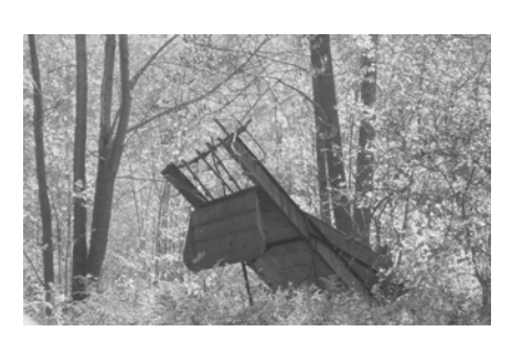
This hay loader was used to scoop loose hay up onto a wagon for transportation to the hay mow.

A good introduction and easy walk on The Trails is a short loop (almost two miles), just north of the Village of Stamford on State Route 10. Park at Archibald Field and follow the gravel Wardwell Lane away from the State road, cross the wood bridge (onto the old Neilsen Farm), and bear right, going up the gradual hill. Bear left as you come into the open area with apple trees. Near the top of the hill, you will see old farm machinery on your right. This was a portion of the Pierce Farm.